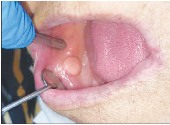
FIGURE 1: Clinical examination showing a pedunculated and well-circumscribed mass.