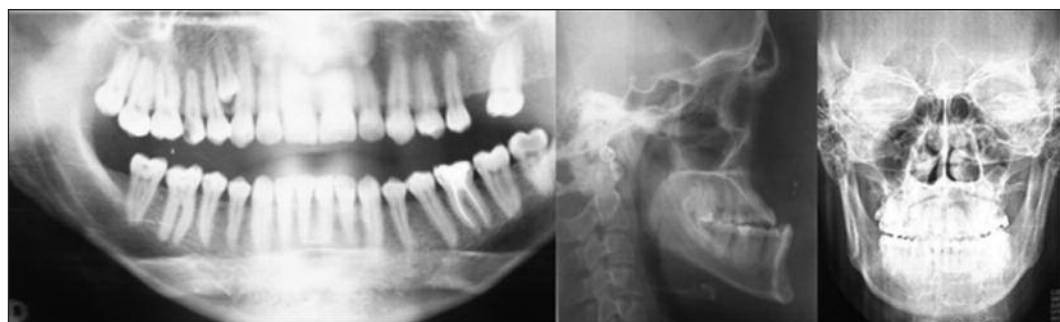
FIGURE 3: Pre-treatment-radiographs views.

(See for colored form http://dishekimligi.turkiyeklinikleri.com/ )