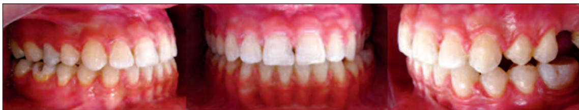
FIGURE 8: Post-treatment intraoral-views. (See for colored form http://dishekimligi.turkiyeklinikleri.com/ )

An acceptable occlusion was achieved (Figure 8). Panoramic radiograph showed no root resorption (Figure 9). Correction of the skeletal deformity improved the patient's speech and pronunciation. As an added benefit, the patient reported a better