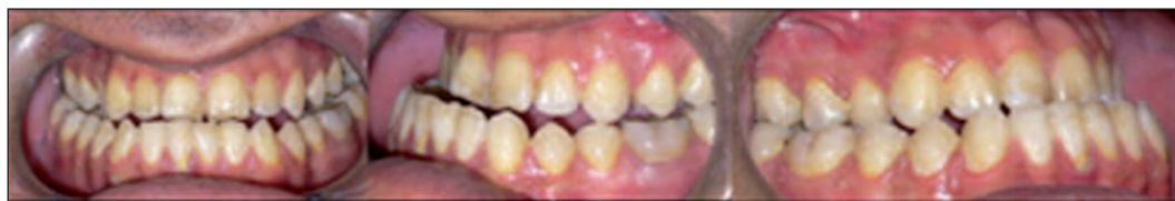
FIGURE 2: Pre-treatment-intraoral views.

(See for colored form http://dishekimligi.turkiyeklinikleri.com/ )