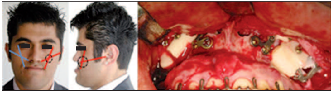
FIGURE 5: Surgical phase, intraoral view of iliac bone augmentation with screw fixation, location of the paranasal grafts. (See for colored form http://dishekimligi.turkiyeklinikleri.com/ )