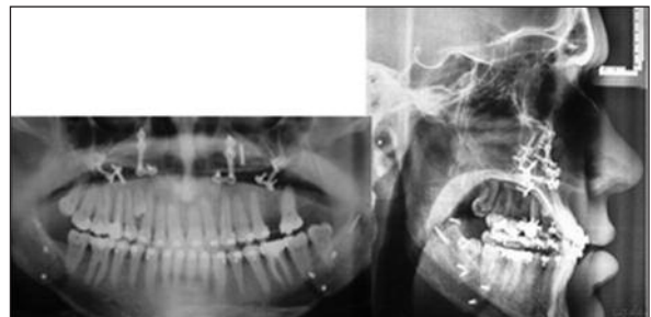
FIGURE 6: Radiographs after surgical phase.

Following the surgery, settling was accomplished with light round wires and vertical elastic mechanics. The patient's cephalometric analysis were re-examined (Figure 6, Table 1). The treatment was concluded in 18 months. Immediately after the removal of the fixed appliances, essix retainers were placed, and the patient was asked to wear them full time for 6 months and at night thereafter