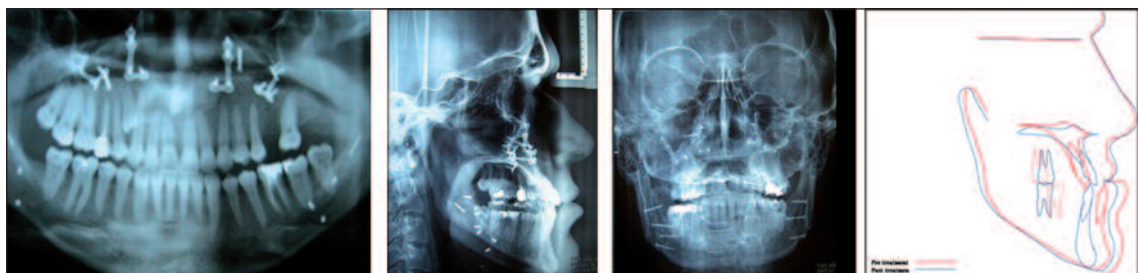
FIGURE 9: Post-treatment-radiographs views and superimposed pretreatment and posttreatment. (See for colored form http://dishekimligi.turkiyeklinikleri.com/ )