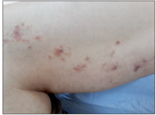
FIGURE 1: Erythematous and violaceous lichenoid papules and plaques in a linear distribution on the thigh.

With these findings we concordant with lichenoid drug eruption. The patient has been diagnosed as letrozole induced linear lichenoid drug eruption. She was prescribed betametasone dipropionate (0,025%) ointment until she could return for follow-up. After one month after initial presentation, on follow-up examination, lesions have not resolved but pruritus has improved significantly. Topical treatment was changed with super-potent corticosteroid ointment and she was asked