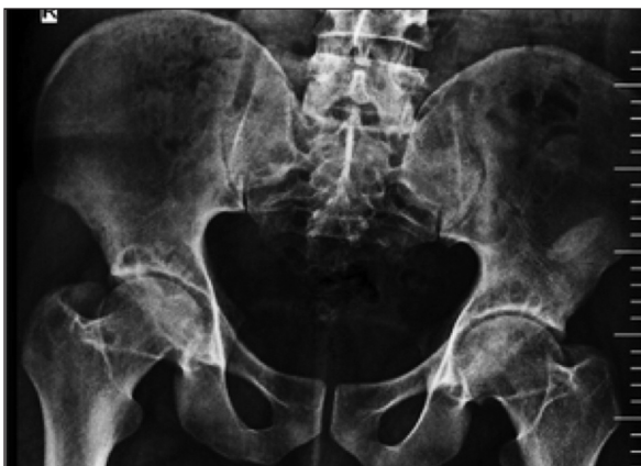
FIGURE 1: Acetabular subchondral cysts and subchondral sclerosis increase are observed in both hip joints, the AP graphy pelvic.

nation. At the follow-up he had pain in his left hip. His pain had inflammatory features. Bilateral range of motion in hip joint, especially the internal and external rotation, was limited in physical examination. The sacroiliac joint (SIJ) examination tests were bilateral positive. The hip radiography showed flattening of the bilateral femoral head and acetabular subchondral cysts (Figure 1). CRP levels were 7.9 mg/dl and proteinuria (1+) was present in the urinalysis. After learning more about the history of the patient it was revealed that he had an appendectomy. He didn't describe oral or genital aphthae, uveitis, genital discharge, skin rash, previously occurrence of joint pain and swelling, weight loss, night sweating, chest or abdominal pain, fever, dry eyes. A first-degree consanguineous marriage between his mother and father was present. The bilateral hip magnetic resonance imaging (MRI) was consistent with chronic sequelae of arthritis (Figure 2). The sacroiliac MRI and abdominal ultrasonography (USG) were normal. The fibrinogen levels were 74 mg/dl (normal range 180-350 mg/dl). The HLA-analysis revealed a positive HLA-B51. The V726A was heterozygous in the FMF gene analysis. Pathergy skin test was negative. With the current situation the patient was diagnosed as FMF and colchicine, sulphasalazine and non-steroidal anti-inflammatory drugs (NSAIDs) were initiated. In the follow-up, the CRP value regressed to 2.5 mg/dl. The micro-protein in the 24-hour urine