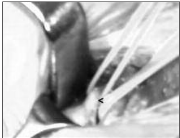
FIGURE 2: N-type TEF was isolated, and divided through a right lower cervical incision. (<) indicates the fistula.

dical therapy for gastro-esophageal reflux was started immediately after and carried on. On the post-operative 1 st year cine-esophagography and bronchoscopy were repeated which revealed absence of gastro-esophageal reflux with a normal anatomy of esophagus and stomach. Medical therapy for gastro-esophageal reflux was terminated and she is still doing well without complications for a follow-up period of three years.