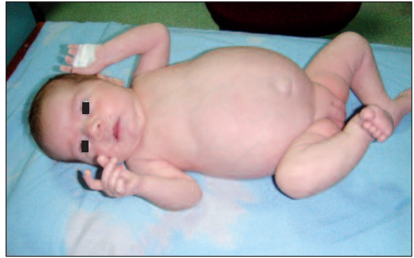
FIGURE 1: Distended abdomen in chylous ascites. (See for colored form http://tipbilimleri.turkiyeklinikleri.com/ )

A 20-days old newborn female baby with abdominal distension was diagnosed with congenital hypothyroidism and was referred to our hospital. She was born at term with caesarean section; her birth weight was 3.6 kg. There was no history of regular follow up during prenatal period. The baby had no complaint after delivery, until the tenth day when abdominal distension developed. She was administered L-thyroxine in an outpatient clinic of another hospital due to high levels of Thyroid-stimulating hormone (TSH) (>100 mIU/ml) at ten days after birth. The patient was referred to our unit because of increasing abdominal distention during this treatment. The physical examination revealed a distended abdomen (Figure 1) with an abdominal circumference of 42 cm. The skin was dry, front fontanel was 3x3 cm. Other system examinations were normal. Ultrasonography (USG) examination revealed disseminated ascites, and no pleural effusion was present. Ecocardiography was normal. The test results were; TSH: 50 mIU/mL (N: 0.34-