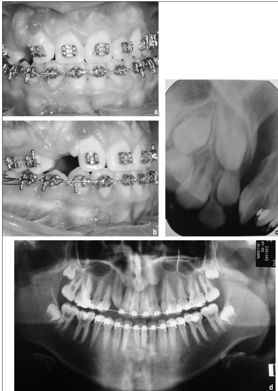
FIGURE 1: Pre-operative records. a and b . Intraoral photos showing the defect region; c . Periapical radiograph showing alveolar cleft region; d . Panoramic radiograph showing impacted mandibular 3 rd molars and cleft region.

tion between the 3D reconstructions of the pre-defined graft volume based on axial CT scans and calculated graft volume according to the Archimedes principle. 15