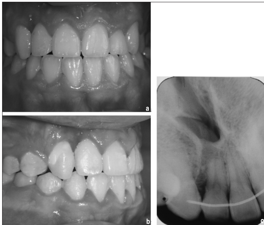
FIGURE 3: Post-treatment records. a and b . Intraoral photos showing the defect region; c . Periapical radiographs showing good bone material on the cleft side.