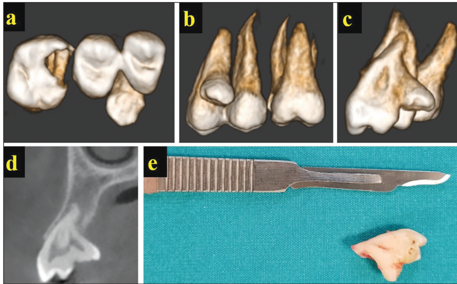
FIGURE 2: The fusion between the maxillary right first premolar and the supernumerary tooth is shown on three-dimensional reconstruction images [(a) inferior view, (b) palatal view, (c) mesial view], cross-sectional slice (d) of cone-beam computed tomography, and post-surgery photograph (e).