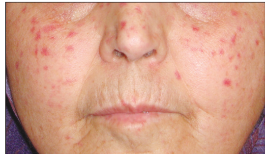
FIGURE 2b: This picture shows per-oral puckering and facial telangiectasia.

Corneal involvement in scleroderma is rare. Peripheral corneal thinning associated with scleroderma is more often inflammatory and ulcerative. Filamentous keratitis, exposure keratitis (secondary to lid changes) and peripheral ulcerative keratitis have all been reported to be associated with SSc. 2-5,11 Extracellular matrix overproduction by fibroblasts is the hallmark of SSc. Activated fibroblasts over-