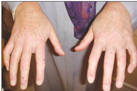
FIGURE 2a: This picture shows flexion contractures of the fingers.