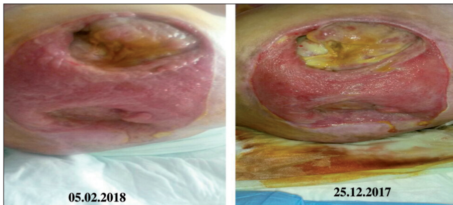
FIGURE 1: 2 nd degree, 8 cm 2 , Amount of exudate (1), Tissue type (2); 3 rd degree, 9 cm 2 , Amount of exudate (2), Tissue type (3).

Risk factors affecting pressure ulcer and development, high morbidity and mortality rates are infection, pain, and depression. Sepsis is the most severe form of infection especially in the elderly patients with impaired nutrition and immune deficiency. Pressure ulcer, prolonging the patient's healing process is a health problem that causes delays in assuming responsibilities and increasing the cost of maintenance economically. 9 There is no ideal and universal method used for the prevention and treatment of pressure ulcers. However treatment includes nutritional support, reduction of pressure, medical and surgical treatment of the wound. Treatment of infected pressure sores includes adequate drainage, complete debridement, elimination of dead spaces, wound care and an-