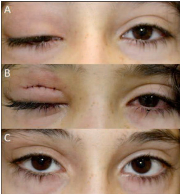
FIGURE 3: A. Pre-operative photograph of the patient (Case 2), with right upper eyelid ptosis and edema. B. One week after the abscess drainage showing the eyelid edema and persisted ptosis. C. All signs and symptoms resolved in the 2 nd month follow up visit.