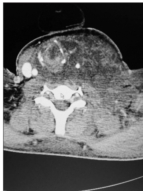
FIGURE 2: Cervical and thoracic CT scans before the operation.

ture antibiogram results were received. The patient in postoperative 18 th month (Figure 3).