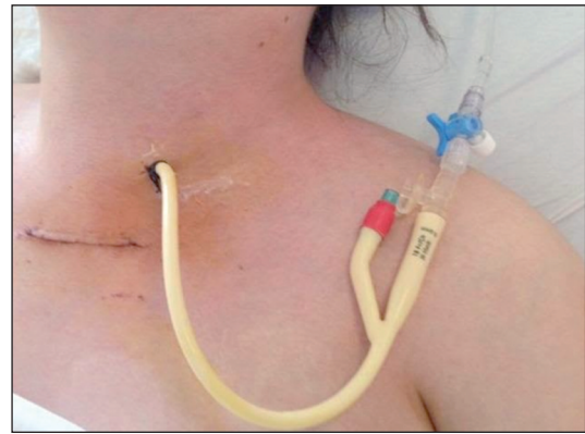
FIGURE 1: View of the catheter inserted in the pretracheal space.

Orhinolaryngology clinic was recommended that the patient should be followed up for oedema and pressure sores. The patient received tracheostomy on the postoperative day 3 due to deterioration of her general condition and increase the pressure sores in the neck area. Following the increase of oedema and pressure sores in the face area and particularly on the left shoulder and arm area, the case was examined by the otorhinolaryngology clinic again. Thoracic and cervical CT scans showed laryngeal and tracheal deviation towards the right side, increase in the air artefacts in the cervical region, new necrosis areas and new loculations in the paratracheal and paracardial areas (Figure 2). Cervical fasciatomy, debridement, drainage and right rethoracotomy, mediastinal re-debridement were decided to be performed. In the follow up, widespread skin necrosis and superficial venous thrombosis were identified. Incision was left open and dressings were applied. Rethoracotomy was performed for the new loculations in paratracheal and paracardial areas. On the first day of the second surgery, malignant hypertension developed. Echocardiography results were normal. The patient was followed up for baroreceptor dysfunction risk. Open cervical wound was controlled with daily change of dressings. The mediastinal catheter was removed after drainage from the mediastinum into the chest tube ceased. The chest tubes were removed after drainage seized and cul-