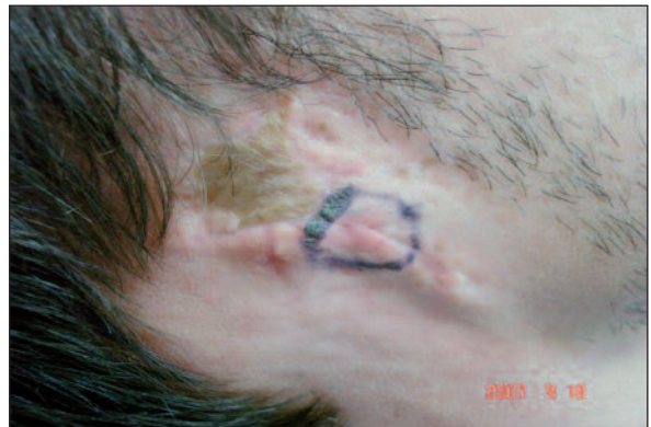
FIGURE 2: Face-bow cusp tip was marked with an indelible pencil on the defect side.

(See for colored form http://tipbilimleri.turkiyeklinikleri.com/ )