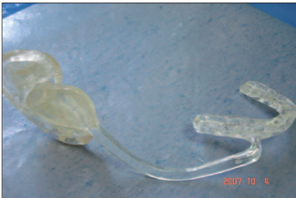
FIGURE 3: The clear acrylic diagnostic prosthesis and clear acrylic resin guide.

It was made sure to use this guide for computerized tomography. Radiologist was informed to scan including the radioopaque material and the area of 3 mm in both sides (Figure 4).