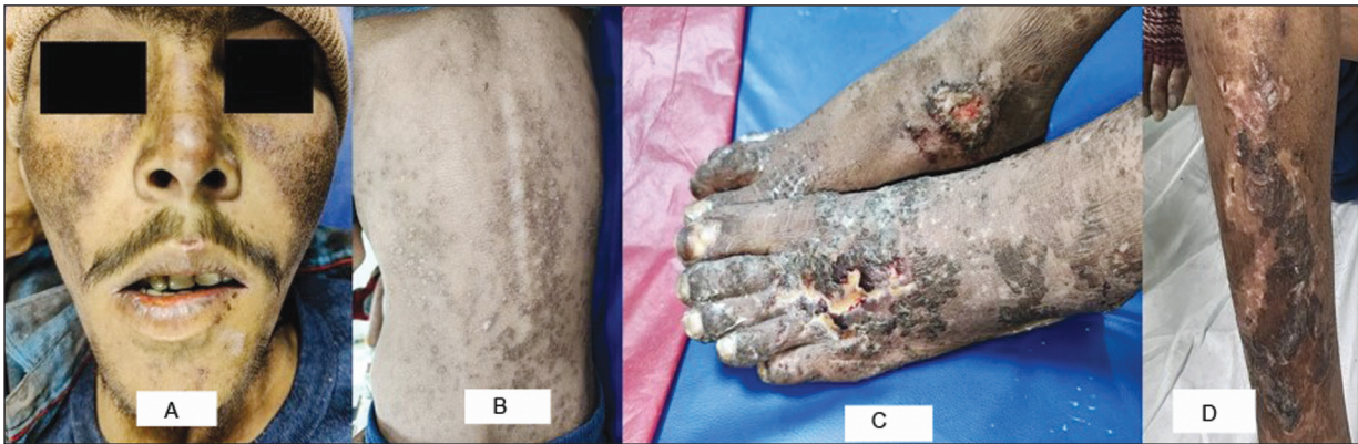
FIGURE 1: a) Erythema and scaling with hyperpigmentation seen over malar area and dorsum of nose. b) Multiple porcelain-white atrophic scars and hyperpigmented macules seen diffusely over back. c) Ulcers with necrotic slough seen over medial malleoli and dorsa of feet and legs along with porcelain-white scars. d) Multiple ulcers, few healing with porcelain-white scarring over extensor aspect of legs.

nea (24/min), 60% oxygen saturation and altered consciousness.