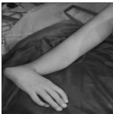
FIGURE 1: Limb defect on her right arm.

The patient was operated electively, under standard cardiopulmonary bypass with the use of two separate venous cannulae. Secundum type ASD was closed by using a pericardial patch. Early