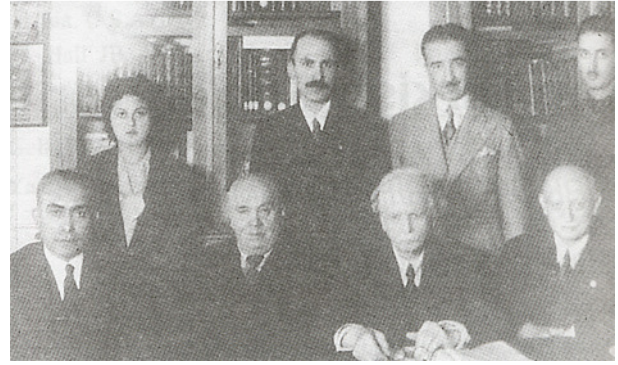
Figure 2. Founder members of the Turkish Society for the History of Medicine

Foreign scientists who are interested in medical history may be members by decision of the executive committee, if they apply to the society's secretary.