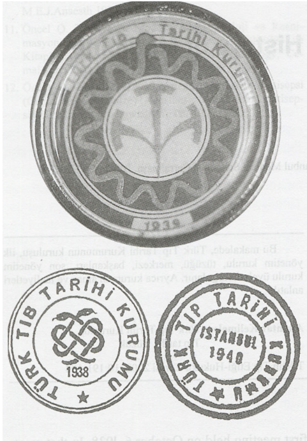
Figure 1. Rosettes and seals of the Turkish Society for the History of Medicine (from the past to today)

and Studies of Medical History. For the first time the Society for the History of Medicine was located in a room and a sign was hung on the door. The society has continued its studies and activities from this center since 1984.