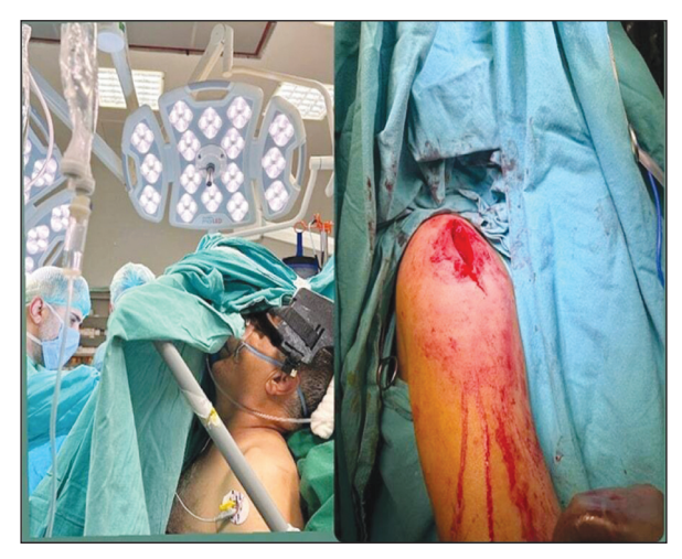
FIGURE 2: Intraoperative condition of the patient.