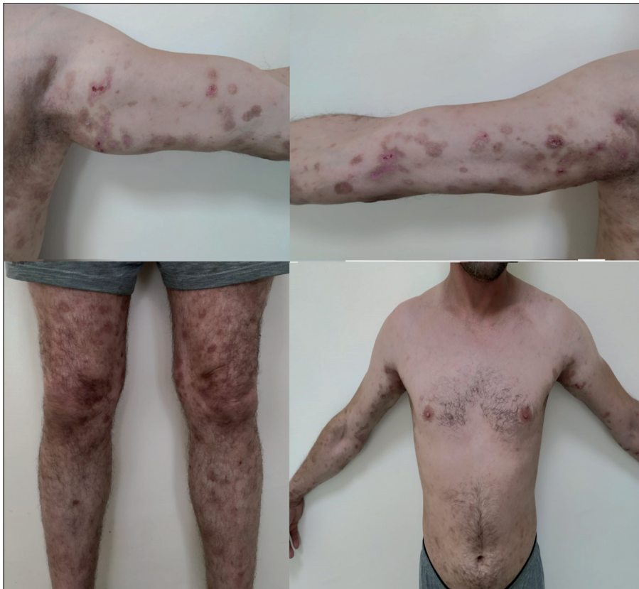
FIGURE 6-9: The patient's existing lesions were completely epithelized by responding dramatically to the treatment.

ysis bullosa acquisita and generalized fix drug eruption. During histopathological examination; in the epidermis, it was observed septant orthokeratosis acanthosis, spongiosis, large bulla formation which is separating the dermo-epidermal junction in the subepidermal area and containing mixed types of inflammatory cells. Inflammatory cells were eosinophil-containing polymorphonuclear leukocytes and lymphocytes and were also found in the perivascular and interstitial areas (Figure 5). Direct immunofluorescence examination of the perilesional skin revealed linear IgA, immunoglobulin G (IgG) and C3c accumulation in the basement membrane in accordance with LABD. After biopsy, the patient was treated with 40 mg/day systemic steroid, topical steroid creams and topical antibiotic creams for erode infected lesions. On the 5 th day of systemic steroid treatment, no new lesion emerged, and the patient's existing lesions were completely epithelized by responding dramatically to the treatment (Figures 6-9). (The necessary permission was taken from the patient).