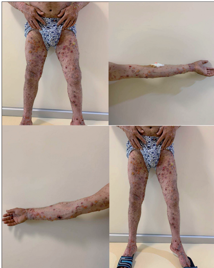
FIGURE 1-4: During the dermatological examination, diffuse, scattered, sharp-edged, on annular erythematous plaques, strained bullous lesions and diffuse erode areas were observed in the trunk and extremities of the patient.

except for a combination of paracetamol + chlorpheniramine which he used intermittently for headache. He had recently used a drug with a combination of paracetamol + chlorpheniramine 6 days before the onset of his complaints. During the dermatological examination, diffuse, scattered, sharp-edged, on annular erythematous plaques, strained bullous lesions and diffuse erode areas were observed in the trunk and extremities of the patient (Figures 1-4). Nikolsky's sign was negative. Examination of the oral mucosa and other mucosal areas was normal. The patient's vital signs were stable. There was no significant findings except for leukocytosis (white blood cell count= 1,500/ \mu l), sedimentation (45 mm/h) and C-reactive protein elevation (33.4 mg/dL) in the laboratory findings. Biopsy was taken for histopathological and direct immunofluorescence examinations