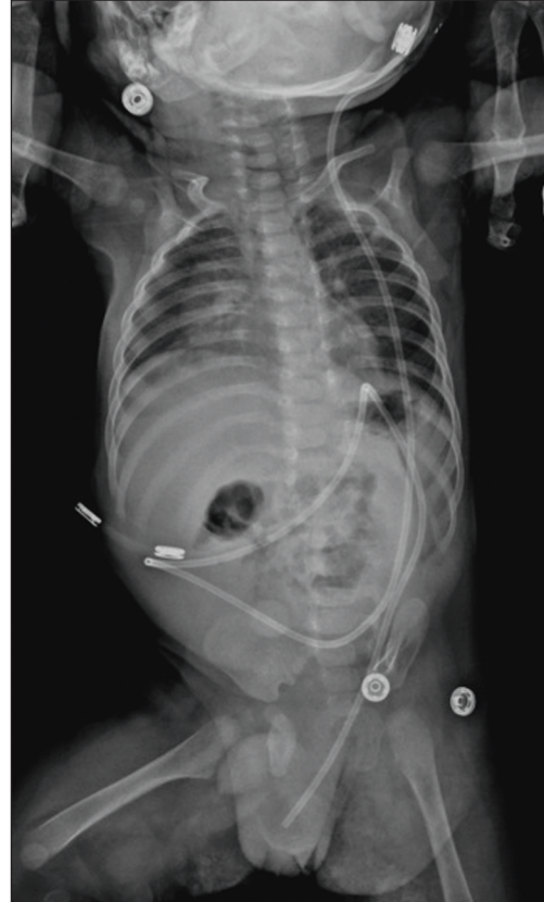
FIGURE 2: Preoperative plain abdominal X-ray.

Informed consent for participating in the study was obtained from the parents of the patient included in the study.