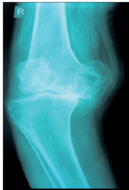
FIGURE 1: Radiological osteoarthritis of the knee.

There was a statistically significant difference between the groups in terms of Constant-Murley shoulder scores ( p=0.001 ; p<0.05 ). As a result of paired comparison for the detection of significance, shoulder scores of patients in Group 4 ( p<0.05 ) were significantly higher than those in Group 1 ( p=0.002 ), Group 2 ( p=0.001 ) and Group 3 ( p=0.002 ). Shoulder scores of patients in Group 3 ( p<0.05 ) were significantly higher than those in Group 1 ( p=0.001 ) and Group 2 ( p=0.001 ). No difference was detected between the shoulder scores of patients in