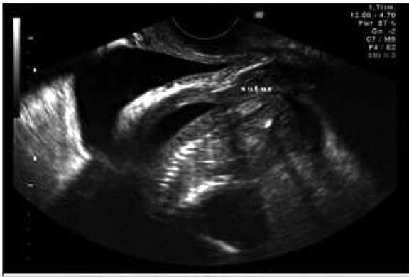
FIGURE 3: Evaluation by TVUSG, ten days after dehiscence repair. The sutures are seen hypoechoic.