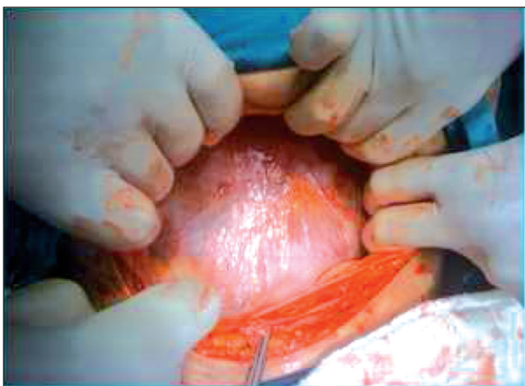
FIGURE 4: The uterus during cesarean section. Lower segment was clean and thick. No signs of dehiscence.

The family refused the tubal ligation suggestion. The abdomen was accessed by Pfannenstiel incision. The uterus had a clean and thick lower segment (Figure 4). A male infant of 1760 gr, with APGAR score of 6-8 was delivered. Uterus was closed in single layer with continuing locked and full-thickness sutures. The postpartum period was uneventful. The infant stayed 14 days at the newborn intensive care unit. Gynecologic examination of woman after 2 years revealed no trait, her menstrual period was regular. In the ultrasound examination the endometrium was regular, and there was a niche appearance of 2 mm. The neurological and physical development of the infant was found in natural limits.