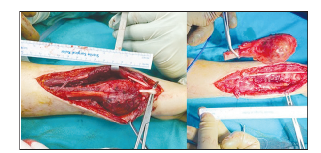
FIGURE 3: In the first image we can see that the lesion includes the extensor carpi ulnaris tendon. In the second image we can see the lesion after removal from the distal radioulnar joint including the extensor tendon ulnaris. Extensor carpi ulnaris lesion was excised because we saw the tumor surrounded the tendon 360°.