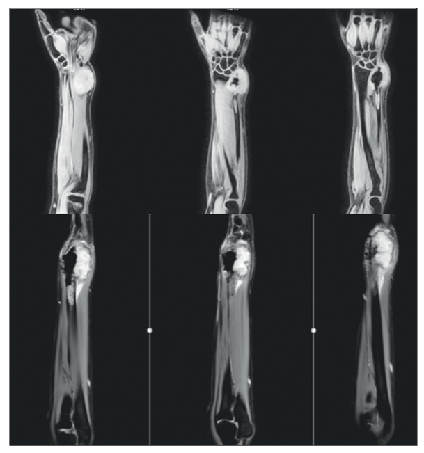
FIGURE 2: Magnetic resonance imaging scan demonstrations of the giant cell bone tumor in distal ulna after 2 surgeries and denosumab treatment. In the figures, we can see the giant cell bone tumor originating from distal ulna and spreading to the soft tissues around the wrist joint.

also taken denosumab treatment in a different hospital. At the state of admission, latest biopsy which was performed was reported as secondary proliferative changes due to denosumab use. Informed consent both from the patient and the doctors were taken before treatment.