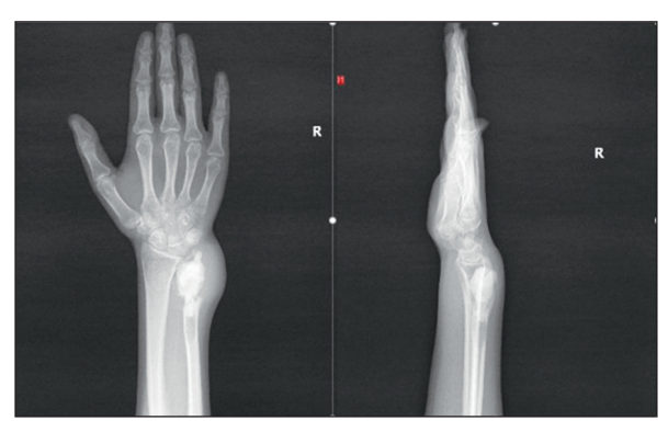
FIGURE 1: Direct X-ray of the patient with local recurrence of giant cell bone tumor in distal ulna, in the preoperative period.