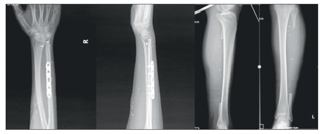
FIGURE 5: Direct X-rays of the patient who underwent a reconstruction by vascular fibula graft for cell bone tumor in the right ulna distal in the post-operative period.

chor and extensor digiti minimi muscle was sutured to extensor carpi ulnaris muscles proximal end. Unlike the previous surgery that we mentioned, we did not perform z-plasty, the patient didn't have palmaris longus muscle. The surgery was completed around 11 hours.