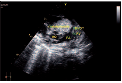
2 V 4.53 m/s p 11.51 mmkb