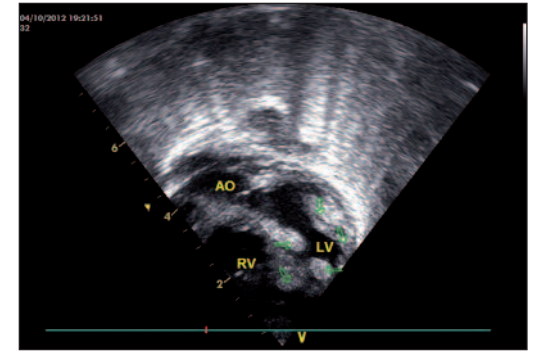
FIGURE 1: Echocardiography showing multiple hyperechogenic nodules within the interventricular septum, the free wall of the left ventricle.

echogenic, multiple, well-circumscribed intramural or intracavitary nodules occurring anywhere within the heart. <sup>1,2</sup> Rhabdomyomas have been known to regress without surgical intervention. Surgical intervention is required when cardiac outflow obstruction causing significant hemodynamic deterioration.<sup>1</sup>