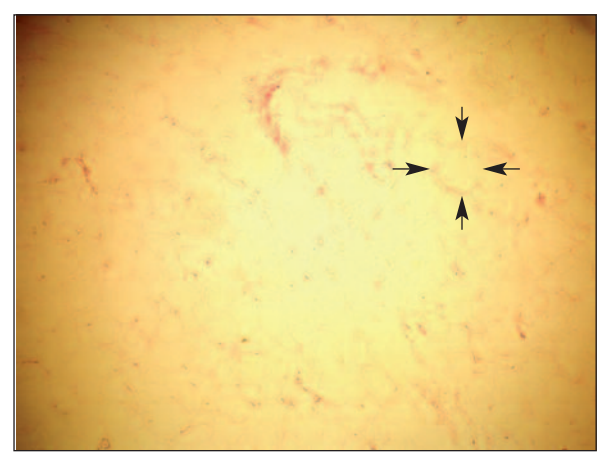
FIGURE 2: Histopathological examination of adipose tissue from the right upper arm. Note the normal and smaller sized fat cells without malignant changes (arrows) (HE, x40).