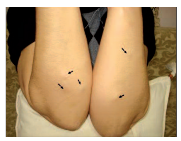
FIGURE 1: Multiple subcutaneous lipomas in both arms.

A 32-year-old female, whose physical examination showed multiple subcutaneous lipomas on her upper trunk, arms and upper legs (Figure 1). It has been learned from the previous history of the patient that she had a treatment because of hyperbilirubinemia when she was a newborn. Athetoid type cerebral palsy was observed in her neurological examination. She was also seen at our clinic with the complaints of painful weakness and burning feet four months ago. Neurological examination revealed sensorimotor polyneuropathy. Nerve conduction studies showed reduction of the sensory conduction velocities. Mini-Mental Status Exam (MMSE) score was 24/30. Disoriented to date and day of the week, good registration but impaired ability to complete serial 7s, impaired attention, and very poor short-term memory were the findings in MMSE. Unable to recall any three items