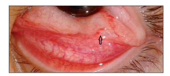
FIGURE 1: Approximately 2 mm conjunctival laceration, subconjunctival emphysema.

Twelve-year-old boy was admitted with a complaint of swelling around the eye to Duzce University School of Medicine, Ophthalmology Clinic. Written informed consent forms were obtained from the patient's family. The images of the patient to be used for scientific purposes were picked up with the receipt of written consent. In the medical history, he said that his brother shot air gun accidentally to his left eye during joking. In the ophthalmological examination of the patient, direct and indirect light reflexes in both eyes were natural and eye movements were free in all directions. The visual acuity was found to be 20/20 in both eyes according to the Snellen chart. Intraocular pressure was measured as 15 mmHg in the right eye and 17 mmHg in the left eye with applanation tonometry. In the anterior segment examination, swelling around the left eye, proptosis, crepitation, tenderness, and pain were present. In the slit-lamp examination, common conjunctival bubble formation (Subconjunctival emphysema), subconjunctival hemorrhage at 4-5 o'clock position and about 2-mm-laceration in the conjunctival fornix of the same area were found (Figure 1). In the posterior segment examination with 1% cyclopentolate, both eyes were evaluated as normal. In the patient's physical examination, swelling with crepitation was present on the left side of the face and around of the left eye (Figure 2). Emphysema and pneu-