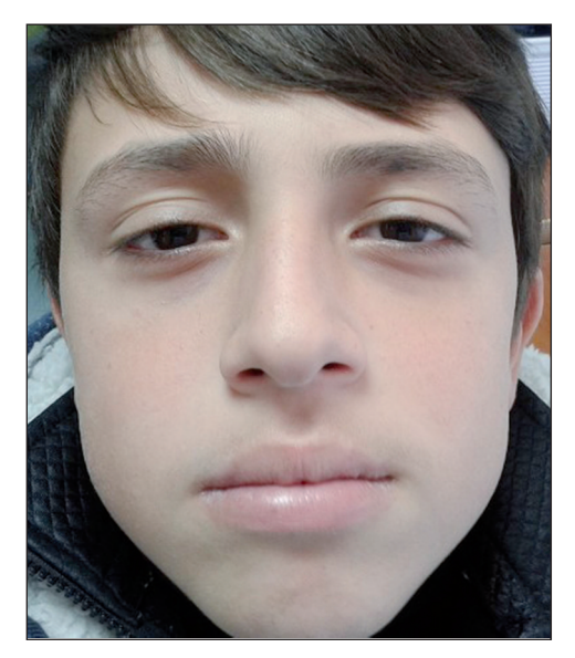
FIGURE 5: .Appearance at the end of the 3rd week.

Orbital emphysema is usually benign and selflimiting condition, but it can also cause distressing clinical conditions such as proptosis, loss of vision, increased intraocular pressure, and central retinal artery occlusion (CRAO).<sup>10</sup> On the basis of these symptoms, patients are divided into four stages. Stage 1: Includes patients without complaints of CRAO, increased intraocular pressure, loss of vision or proptosis or the patients with air accumulation around the orbita clinically and radiological confirmed. Stage 2: Includes patients without complaints of CRAO, increased intraocular pressure and loss of vision but with proptosis. Stage 3: Includes patients with complaints of loss of vision and proptosis, intraocular pressure may or may not be increased, CRAO is not present. Stage 4: All the