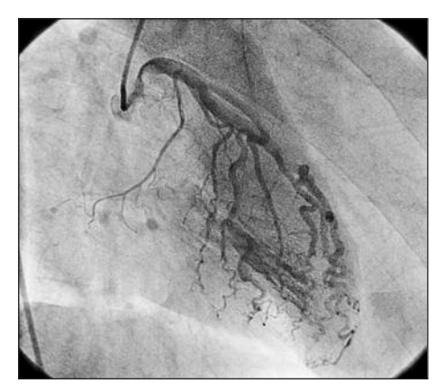
FIGURE 1: Angiography of left coronary system on right anterior oblique view demonstrating a fistula that involves the left anterior descending artery with drainage into the left ventricular chamber.

According to the literature known until 1999, the incidence of coronary anomalies ranged between 0,3-1,3% for the people in general population undergone a cineangiogram for suspected obstructive disease.<sup>2-12</sup> However, Angelini and co-workers have reported a higher incidence (5,6%) than previous studies, and this discrepancy was explained as a result of their strict methodology, which was proposed and adopted by themselves.<sup>13</sup> The role of