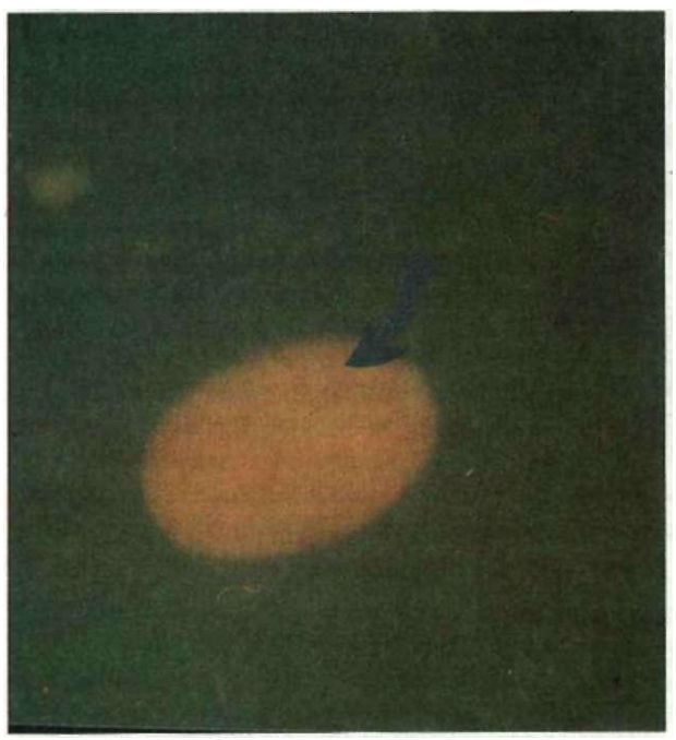
Figure 3. X chromosome in an interphase nucleus from directly fixed amniotic fluid (arrow). (Biotin-labelled human a-satellite DNA probe (DXZI-ONCOR) counterstain: Propidium-iodide).

be used to reveal the location of these sequences and to quantify their copy number. The technique can be applied to metaphase chromosome spreads and to interphase nuclei obtained from cells cultures, to freshly fixed interphase nuclei fixed on slides or to interphase nuclei fixed in suspension to preserve their three-