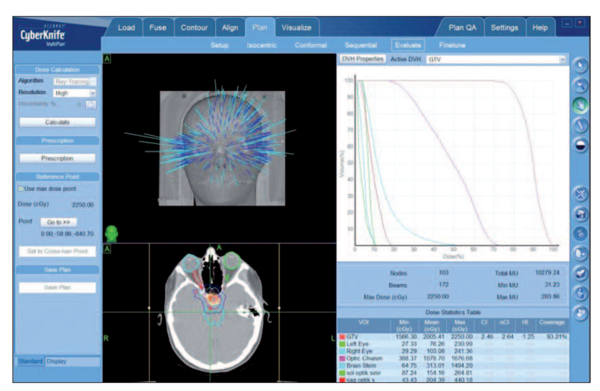
FIGURE 2: CyberKnife treatment planning images. (See for colored form http://tipbilimleri.turkiyeklinikleri.com/)

line in 5 fractions. The limiting factor for radiosurgery of the pituitary lesion is the radiation dose to the optic apparatus. The tolerable dose for the optic chiasma and optic nerves is set to 10 Gy.12 Thus, we used FSRT instead of radiosurgery to minimize the dose delivered to the optic chiasm adjacent to the infundibulum. The maximum calculated dose delivered to the tumor and the optic chiasm was 22 Gy, and 16,7 Gy, respectively. The patient tolerated radiation without any acute incident and was followed-up clinically and by MRI three months after treatment. After the FSRT procedure, she continued to receive paclitaxel and gemcitabine. Polyuria and nocturia started to releive starting from the first few days of treatment. The prescribed dose was completed without the development of any acute morbidity. The threemonth follow-up MRI revealed a 70% contraction in tumor size, accompanied by disappearance of the symptoms and the laboratory findings associated with DI (Figure 3). Serum electrolytes, cortisol, and thyroid hormone levels were within normal reference ranges. Unfortunately, the rapid progression