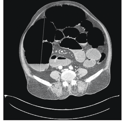
FIGURE 1: Case 1 dilated colon image in abdominal CT. CT: Computed tomography.

A 72-year-old female patient was followed up in the service after ventriculoperitoneal shunt insertion. During this period, the patient was admitted to the intensive care unit due to the sudden development of unconsciousness in the patient who was hypertensive. In her anamnesis; it was learned that she had hypertension for 5 years and heart failure for 2 years. In the brain CT, bleeding was detected in the intraparenchymal area. She was operated by a neurosurgeon. The patient was admitted to the postoperative intensive care unit. During the followup, the patient who developed abdominal distension on the postoperative 4th day and had no stool output, showed distension in the colon and air-fluid levels in the abdominal CT (Figure 2). Ogilvie syndrome was diagnosed after other diagnoses that could cause obstruction were excluded. There was no abnormal finding in the laboratory results of the patient. The patient was administered 2 mg of neostigmine intravenously in approximately 5 minutes. The dose was repeated approximately 6 hours later. The patient was started on metoclopramide treatment prokinetic. The patient's symptoms regressed on the 3<sup>rd</sup> day of treatment. In the follow-ups, the patient was transferred to the service on the 7th day of her hospitalization. Informed consent was obtained from the patient's family.