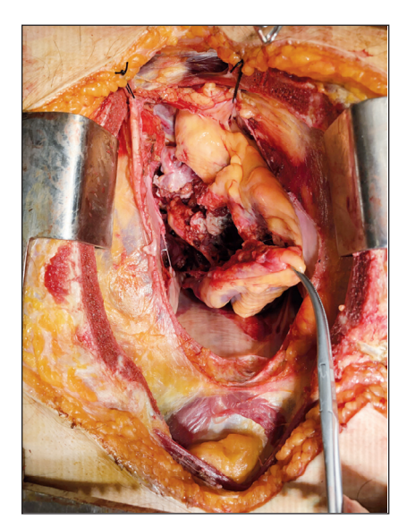
FIGURE 3: The right ventricle, inferior vena cava, superior vena cava, aorta, and right pulmonary veins were destructed.