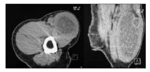
FIGURE 2: Axial (left) and sagittal (right) computerized tomography demonstrates that hypodense mass confined within the biceps brachii.

of the lesion; immunoelectrophoresis is the most specific method.<sup>5</sup> US is useful in diagnosis, showing the size, localization and type of the cyst. The sen-