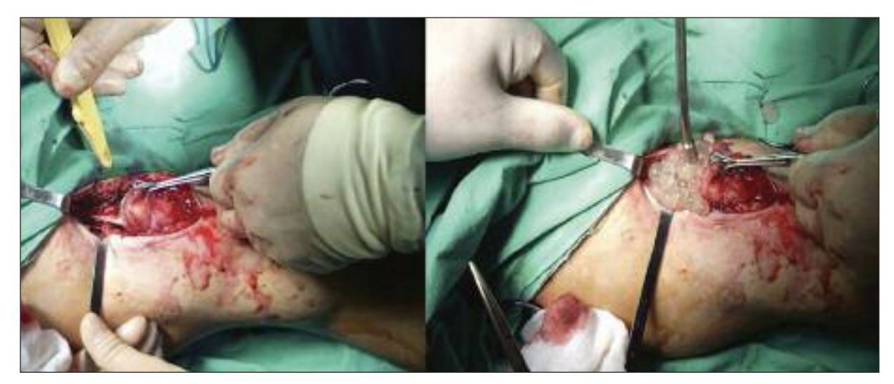
FIGURE 3: Intraoperative appearance of a hydatid cyst within the right biceps brachii.

of the lesion; immunoelectrophoresis is the most specific method.<sup>5</sup> US is useful in diagnosis, showing the size, localization and type of the cyst. The sen-