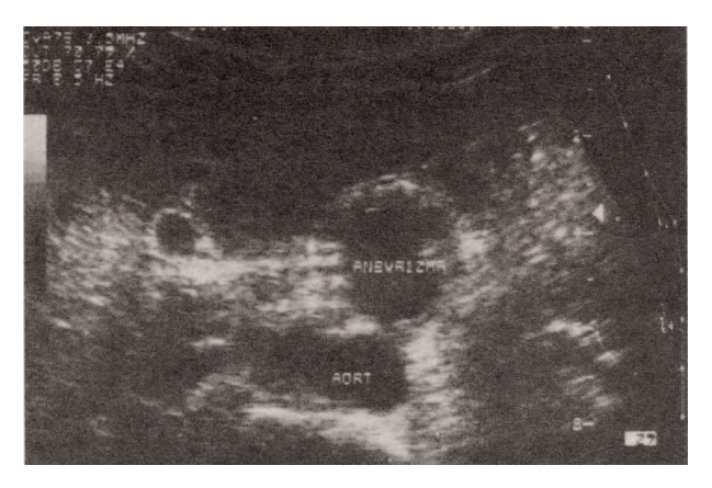
Figure 1. Dupplex Sonography showing a coeliac artery aneurysm measuring 26x28x29 mm in front of the abdominal aorta.