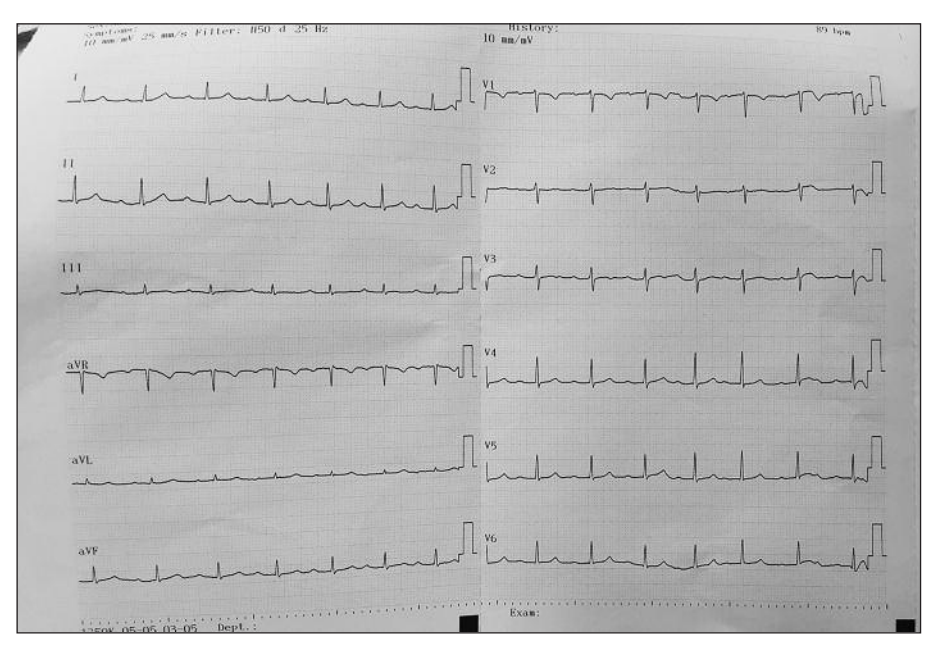
FIGURE 2: Patient's control ECG eight hours later, PR interval was prolongation (0.26 sec).

ever, clinical studies in the 1970s and 1980s showed that mianserin had no cardiotoxic side effects, such as prolongation of the PR interval, widening of the QRS complex, changes in T wave amplitude, or changes in QT duration. However, in 1978, Burgess et al. reported that mianserin could cause reversible prolongation of the QT interval.