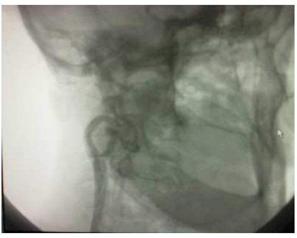
Figure 2. Lateral angiographic view obtained with a selective left carotid artery injection demonstrating normal left carotid angiogram.

In this paper, we present a case with an ectopic salivary tissue within the left carotid bifurcation. Ectopic salivary gland tissue occurs in many sites within the head and neck region and has even been found in other anatomical sites including anal mucosa. Head and neck site involvement includes the lateral and posterior neck, tongue, middle ear, thyroid, pituitary gland and mandible.<sup>3,4</sup> Carotid body tumors are relatively rare tumors that originate from paraganglionic tissue in the neck and are