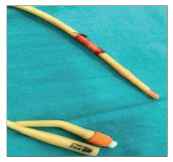
FIGURE 2: Left saphenous vein graft.

and urethral regions. For initial process, an extended Singapore flap tissue superior to inguinal ligament with length and width of 18 and 8 cm respectively, was elevated from the Left Anterior Superior Iliac Spine. During the flap surgery, the left great saphenous vein was dissected at six centimeters length from the femoral vein spill and taken as graft (Figures 2, 3). Urethral edges were refreshed and an urine catheter at 16 F size was placed in the bladder and inflated by passing through the distal urethra, vein graft and proximal urethra. Proximal and distal urethral anastomoses were also performed. The Singapore flap has been tightly adapted around the grafted segment of urethra. The entire defective area was covered via scoring the scrotal skin and Singapore flaps together. The flap donor site was primarily closed and a pillow was