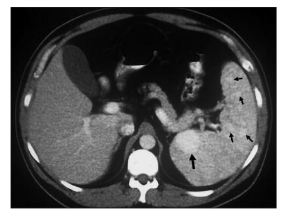
FIGURE 2: Abdominal CT study in late veneous phase shows multiple fullenhanced nodular lesion (black arrows) in splenic parenchyma.