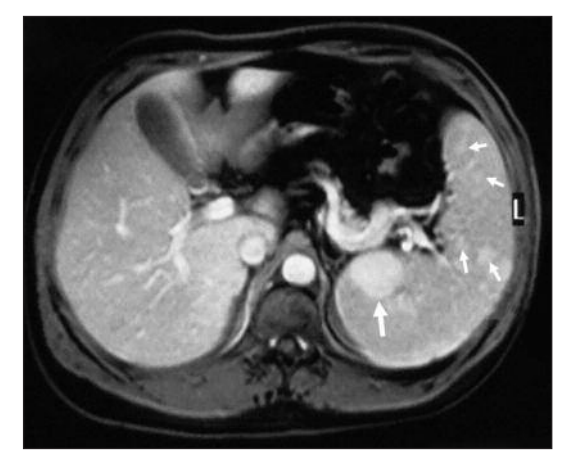
FIGURE 3: Abdominal MRI examination depicts multiple full-enhanced nodular lesion (White arrows) in late veneous phase.

tion.<sup>1</sup> In the current study, a literature review of splenic HE was conducted following a search of PubMed using the key words hemangioendothelioma and spleen or splenic hemangioendothelioma. Including seven cases in total, five of them were adults and two were in the pediatric age group. Non-specific symptoms such as weakness or abdominal swelling can be seen in patients with HE. In addition to these findings, palpable mass, hematologic abnormalities, hypo-hypersplenism, normochromic-normocytic anemia, trauma related consumption coagulopathy splenic rupture organ metastases and splenic rupture have been reported.<sup>1,2,7-10</sup>