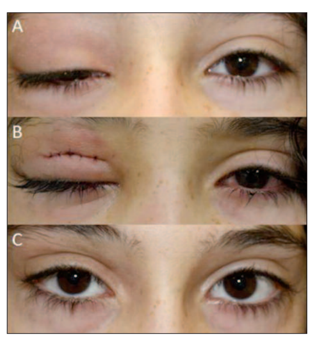
FIGURE 3: A. Pre-operative photograph of the patient (Case 2), with right upper eyelid ptosis and edema. B. One week after the abscess drainage showing the eyelid edema and persisted ptosis. C. All signs and symptoms resolved in the 2^{nd} month follow up visit.