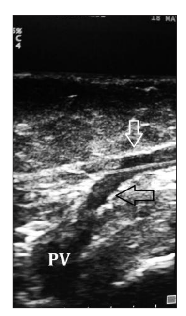
FIGURE 3: The white arrow is showing the small saphenous vein and the radiofrequency ablation catheter inside the SSV. The black arrow is showing the Type-B saphenopopliteal junction. PV: Popliteal vein.

In contrary to the GSV, which has less anatomic variations, the anatomy of the SSV demonstrates significant variability concerning the connection with the popliteal vein (PV).<sup>3</sup> Therefore, a classification system for the saphen opopliteal junction (SPJ) was established by the International Union of Phlebology (IUP). This system concentrates on the type of the junction (SPJ) and its interaction with the cranial (thigh) extension rather than the junctional (SPJ) level.<sup>4</sup> Type-B SPJ is a rare variation and seen only in 15.1% of the studied population.<sup>3</sup>